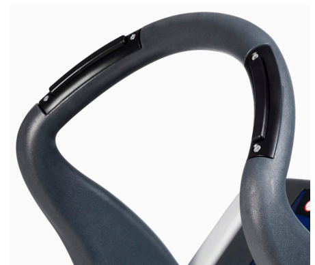
You have a safety switch practically placed on the handle for your convenience