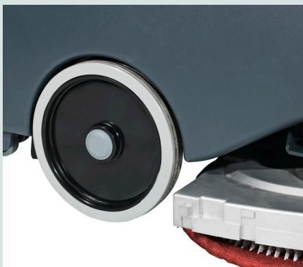
Adjustable machine deck and 34 kg down pressure for heavy-duty tasks offer you the best opportunities for all round cleaning