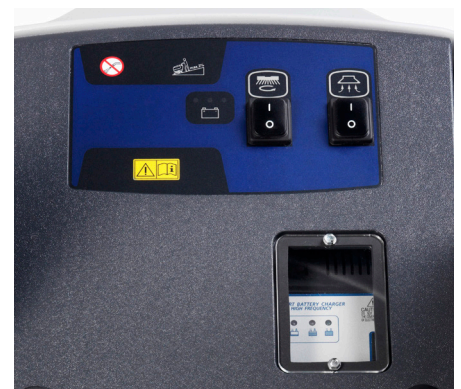
As easy as can be: You can effortlessly operate the SC450 by two buttons and a switch only