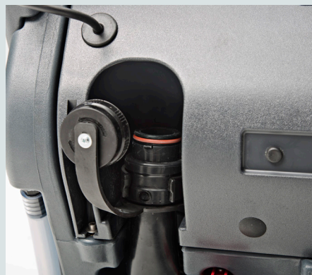
You get drain hose with soft, squeezable section enabling manual flow control, and curved squeegees for better performance and drier floors