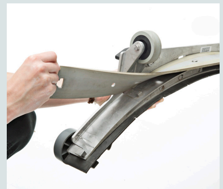
You are able to use the squeegee blades on both sides thus saving costs. And changing is easy. You don't need any tools